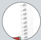
Translucent tank with level indicator