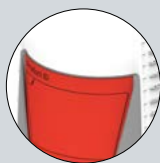
Content identifying system